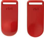
CO colored shiny lacquering