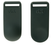
BZ pvd matt black