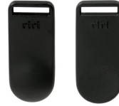
CP colored matt lacquering