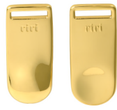
XV pvd shiny gold