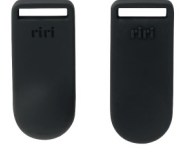
KK rubber coated effect