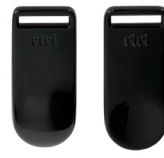
BW pvd shiny black