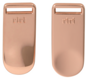
PG pink gold