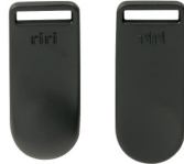
LH colored semi-matt protected lacquering